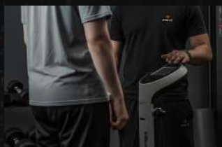
فحص Inbody واستشارة