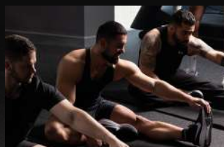
حصص لياقة جماعية مجانية