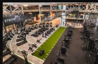
دخول لمدة 24 ساعة إلى النادي ومنطقة الاستشفاء والسبا

استمتع بخدمة السبا الفاخرة عند الاشتراك في العضوية السنوية (12 جلسة في السنة)